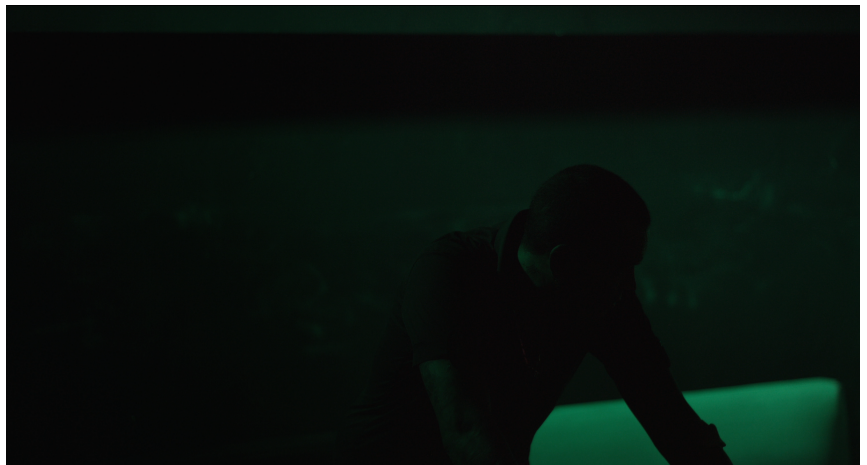
Miguel Calderón, video still of Camaleón , 2016.

kurimanzutto gob. rafael rebollar 94 col. san miguel chapultepec 11850 mexico city