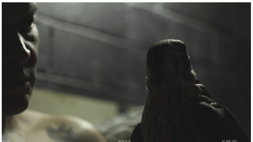
Miguel Calderón, video still of Camaleón , 2016.