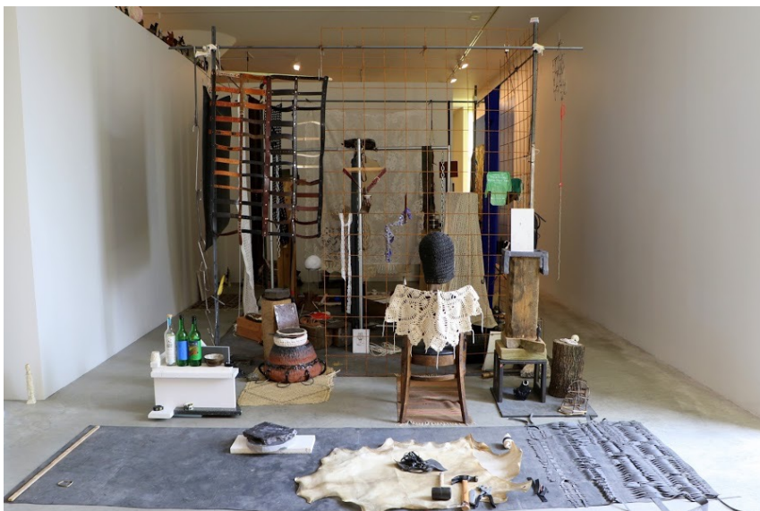
installation view of The master's tools will never dismantle the master's house o concentrate o chiquita pero picante , 2016