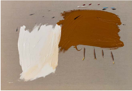
Death Threats, 2021

Acrylic on canvas 59.4 x 84.1 x 4 cm (23.39 x 33.11 x 1.57 in.)