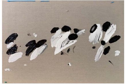
A Space Control Mission, 2021

Acrylic on canvas 59.4 x 84.1 x 4 cm (23.39 x 33.11 x 1.57 in.)