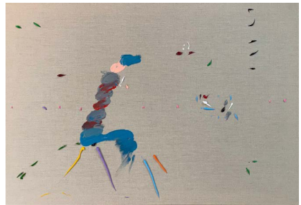
Chernobyl's Offspring, 2021

Acrylic on canvas 59.4 x 84.1 x 4 cm (23.39 x 33.11 x 1.57 in.)