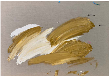
End Insomnia, 2021

Acrylic on canvas 59.4 x 84.1 x 4 cm (23.39 x 33.11 x 1.57 in.)