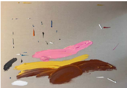
Global Record , 2021

Acrylic on canvas 59.4 x 84.1 x 4 cm (23.39 x 33.11 x 1.57 in.)