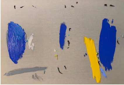
A Cut in Jobs and Closure of Branches, 2021

Acrylic on canvas 59.4 x 84.1 x 4 cm (23.39 x 33.11 x 1.57 in.)