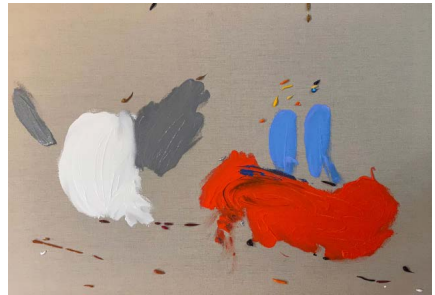
The Candidates' ridicules, 2021

Acrylic on canvas 59.4 x 84.1 x 4 cm (23.39 x 33.11 x 1.57 in.)