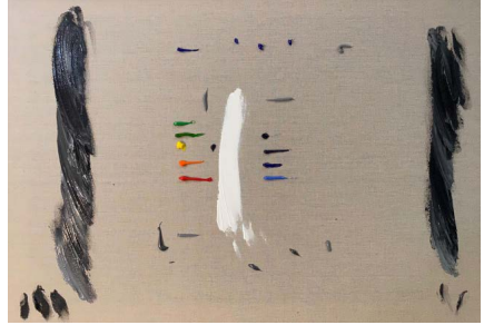
The New Label, 2021

Acrylic on canvas 59.4 x 84.1 x 4 cm (23.39 x 33.11 x 1.57 in.)