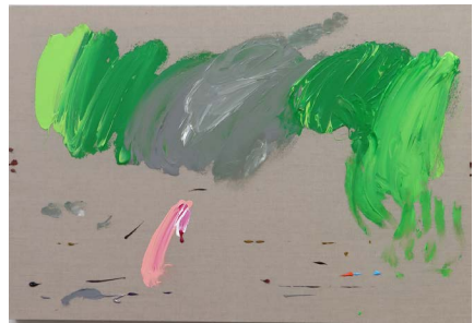
Paris, Stockholm and Barcelona, 2021

Acrylic on canvas 59.4 x 84.1 x 4 cm (23.39 x 33.11 x 1.57 in.)