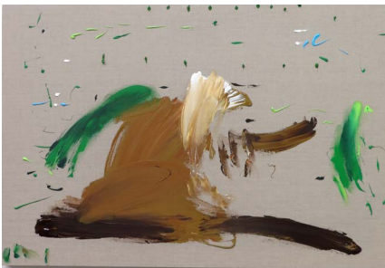
A TikTok dance, 2021

Acrylic on canvas 59.4 x 84.1 x 4 cm (23.39 x 33.11 x 1.57 in.)