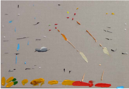
Rents in Berlin, 2021

Acrylic on canvas 59.4 x 84.1 x 4 cm (23.39 x 33.11 x 1.57 in.)