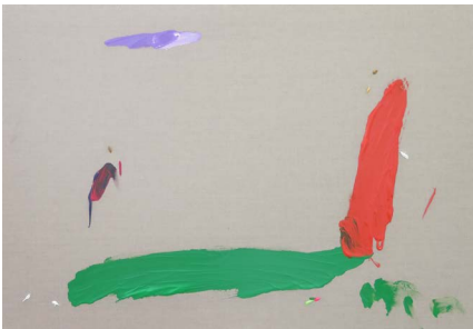
To almost be the hero, 2021

Acrylic on canvas 59.4 x 84.1 x 4 cm (23.39 x 33.11 x 1.57 in.)