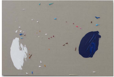
Fears from the West, 2021

Acrylic on canvas 59.4 x 84.1 x 4 cm (23.39 x 33.11 x 1.57 in.)