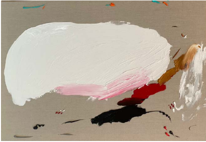
Te olvidas de todo, 2021

Acrylic on canvas 59.4 x 84.1 x 4 cm (23.39 x 33.11 x 1.57 in.)