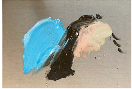
Las pantallas digitales, 2021

Acrylic on canvas 59.4 x 84.1 x 4 cm (23.39 x 33.11 x 1.57 in.)