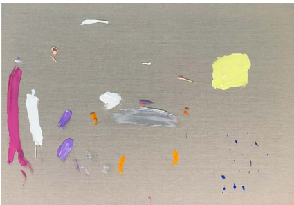
Una tonelada de agua, 2021

Acrylic on canvas 59.4 x 84.1 x 4 cm (23.39 x 33.11 x 1.57 in.)