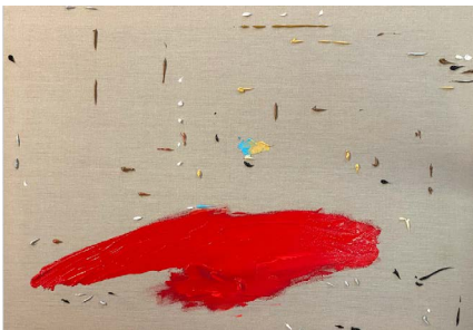
Capital de multimillonarios, 2021

Acrylic on canvas 59.4 x 84.1 x 4 cm (23.39 x 33.11 x 1.57 in.)