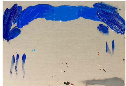
Luz verde, 2021

Acrylic on canvas 59.4 x 84.1 x 4 cm (23.39 x 33.11 x 1.57 in.)