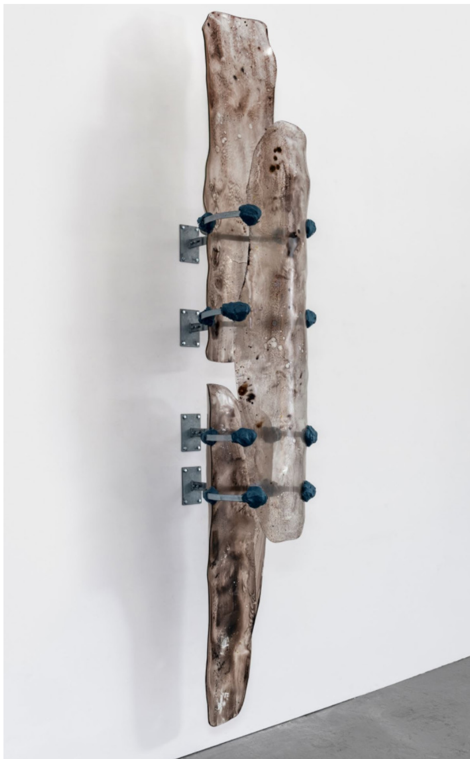
Nairy Baghramian, Dwindler_Sludge (2018). Glass, zinc coated metal, coloured epoxy resin. 327 x 57 x 71 cm. Courtesy the artist and Marian Goodman Gallery. Photo: Alex Yudzon.

Nairy Baghramian: Ambivalent Abstraction Pobocho, Paulina Ocula, August 28, 2020