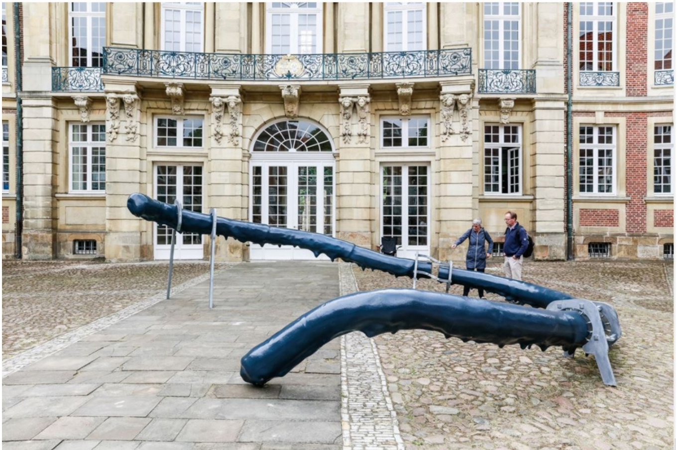
Nairy Baghramian, Beliebte Stellen / Privileged Points (2017). Skulptur Projekte Münster (10 June–1 October 2017).

Going back to the problem of abstraction as a retreat, a German journalist described the piece as being an abstract, useless, and boring thing that should disappear, and it almost sounded like I should disappear. Whatever criticism arises, I take it seriously, but in this case, I had my doubts. In the end, Privileged Points didn't find a spot in Germany. It went into SFMOMA's collection and is currently shown on the same site as a previous work by Dan Graham . It includes the traces of the previous work and it makes space for something else while reminding us of what was there before. The work has also travelled to the Minneapolis Sculpture Garden of the Walker Art Center and to Mudam Luxembourg.