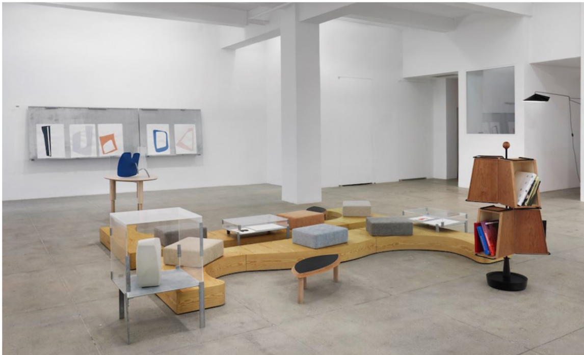
Exhibition view: Nairy Baghramian and Janette Laverrière, Work Desk for an Ambassador's Wife, Marian Goodman Gallery, New York (7 November–20 December 2019).

Often, however, Baghramian allows her work to serve as a presentation platform for that which she admires—a gesture that highlights the generosity that pervades her entire practice. For a recent show at Marian Goodman Gallery in New York , Baghramian showcased the work of designer, artist, and political activist Janette Laverrière, continuing a collaboration that began years prior to Laverrière's death in 2011, to explore the many possibilities and contradictions surrounding object-making ( Work Desk for an Ambassador's Wife , 7 November–20 December 2019).