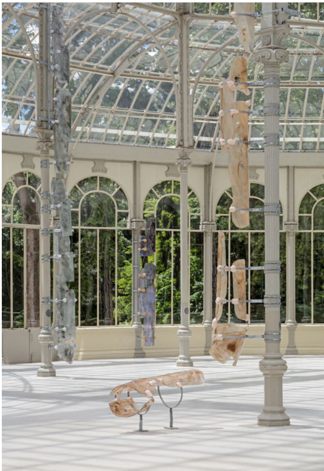
Exhibition view: Nairy Baghramian, Breathing Spell, Reina Sofia, Palacio de Crystal, Madrid (17 May 2018–14 October 2018). Courtesy the artist and Marian Goodman Gallery.