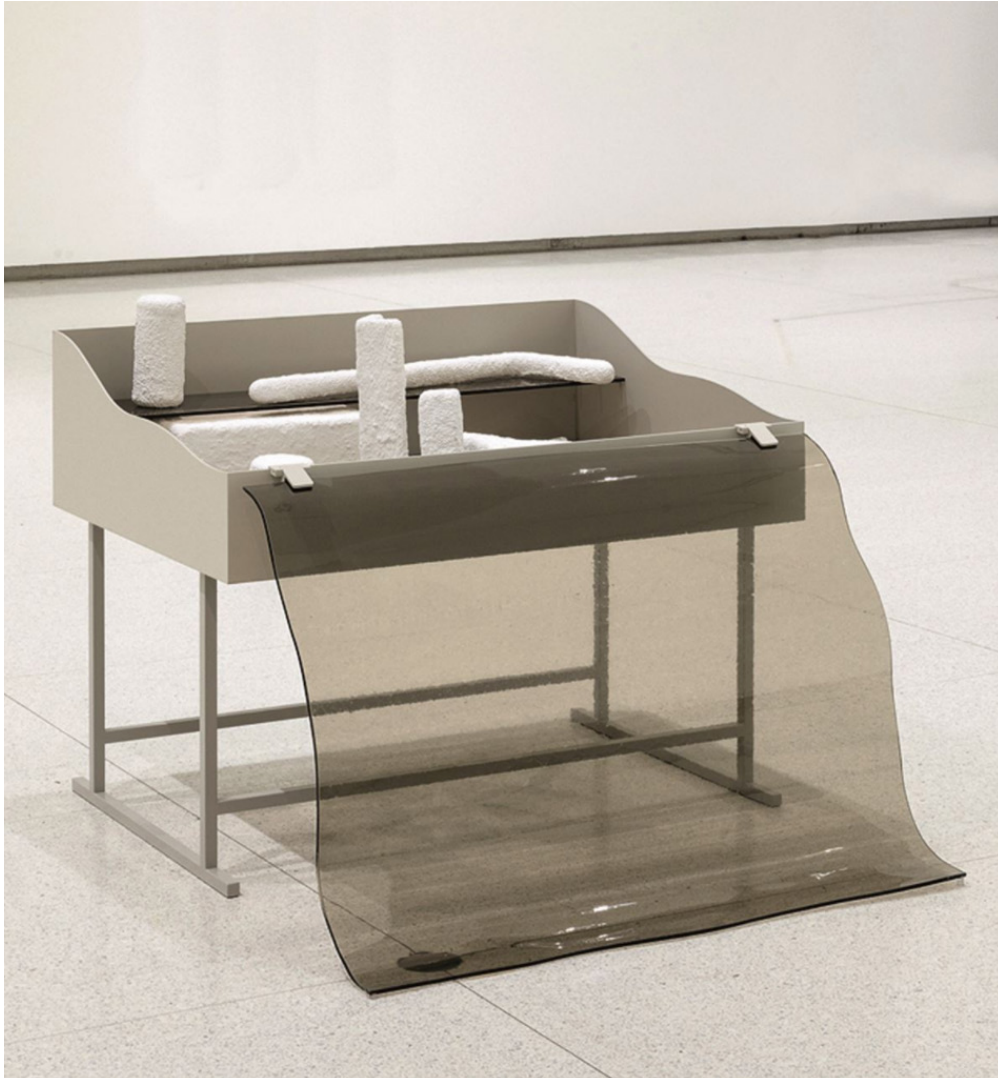
Nairy Baghramian, Formage de Tête (Vitrine Rafrâichirée) (2016). Lacquered metal, glass, porcelain. approx. 101,6 x 124,46 x 144,78 cm (HxWxD). Exhibition view: Déformation Professionnelle , Walker Art Center, Minneapolis (8 September 2017–5 February 2018).

This has made me think about images and image-making, and how abstraction figures into this equation. At times, abstraction is thought of as a retreat from the world, or conversely, as a vehicle for transcendence, and I'm interested in abstraction's capacity to instead represent the unrepresentable, and still be very much part of the world and engage in the politics of a given moment. I think maybe this is by virtue of its resistance to giving over a figure for visual consumption. It's worthwhile to think about that in relation to your work, which has so much to do with the body and has so many references to the body, but is ultimately abstract.