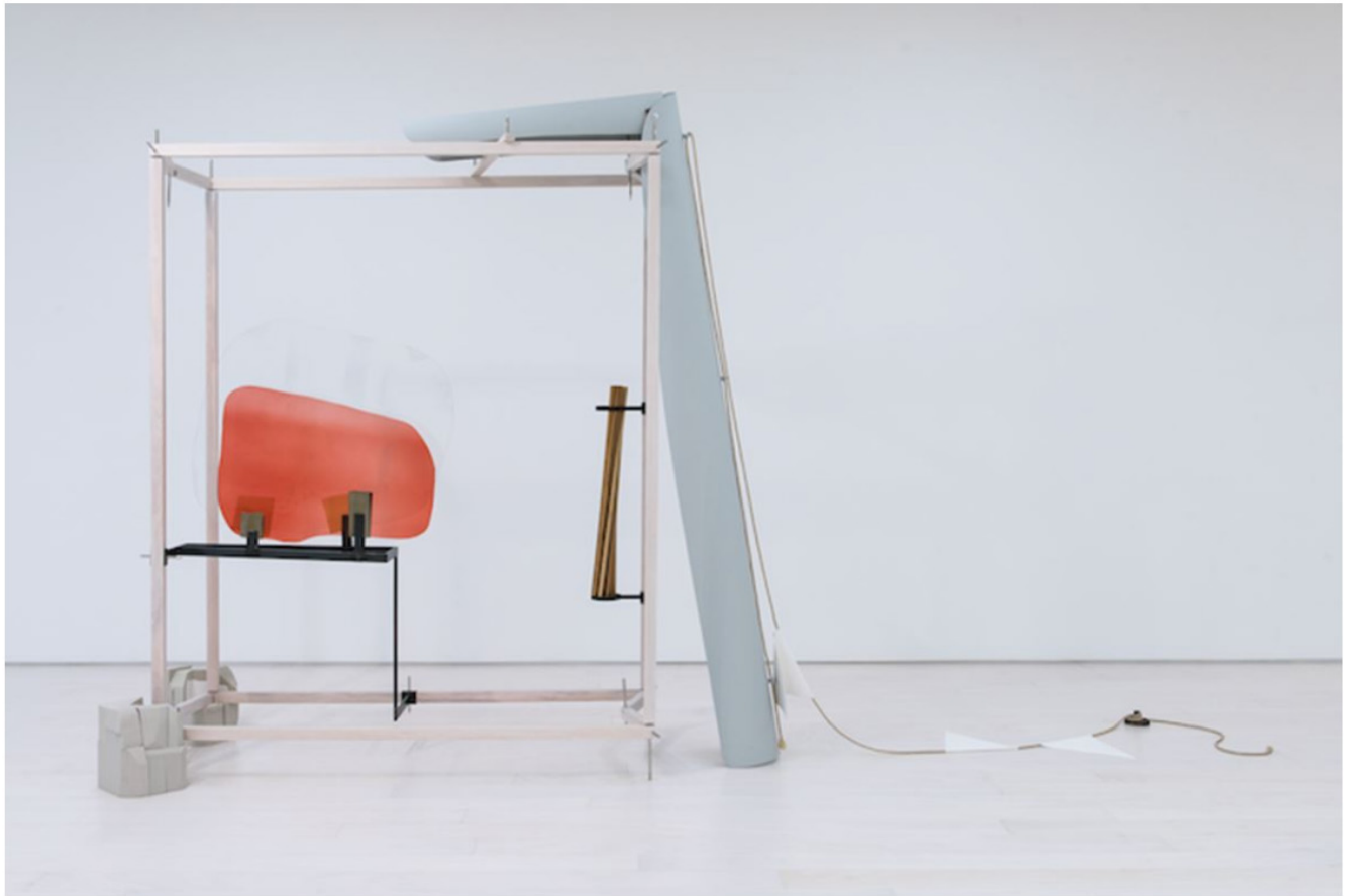
Nairy Baghramian, Drawing Table (Homage to Jane Bowles) (2017). Various materials. Exhibition view: documenta 14, Athens (8 April–16 July 2017).

Baghramian's sculptures not only resemble bodies, however—they also behave like bodies. Their individual elements work together like anatomical systems—propping up, supporting, and sustaining each other. The Iron Table (2002), presented in Kassel at documenta 14 (10 June–17 September 2017) and revisited in a separate sculpture for the Athens iteration of the exhibition (8 April–16 July 2017), interprets Jane Bowles' short story The Iron Table (1943). An unidentified couple sit either side of an iron table that has been dragged over for their use by a waiter, acting as a prop to a strained argument about sudden changes to their plans to travel to the desert. The artist translates this evocative scene into a skeletal structure made up of separate parts containing a red, heart-like lozenge of red.