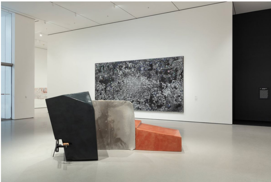
Nairy Baghramian, Maintainers A (2018). Pigmented wax over styrofoam, cast aluminium, and painted aluminium clamp with cork. Overall approximately 164 x 370 x 230 cm. Exhibition view: Worlds to Come , Gallery 215, The Museum of Modern Art, New York. Fund for the Twenty-First Century. © 2020 Nairy Baghramian. Digital Image © 2020 The Museum of Modern Art, New York. Photo: John Wronn.

Pobochoa spoke from her apartment in Brooklyn, New York, where she had been working since the Covid-19 quarantine began in mid-March, to Baghramian, who had just returned to her Berlin apartment from her studio nearby. The exchange below is an expanded and edited version of their conversation.