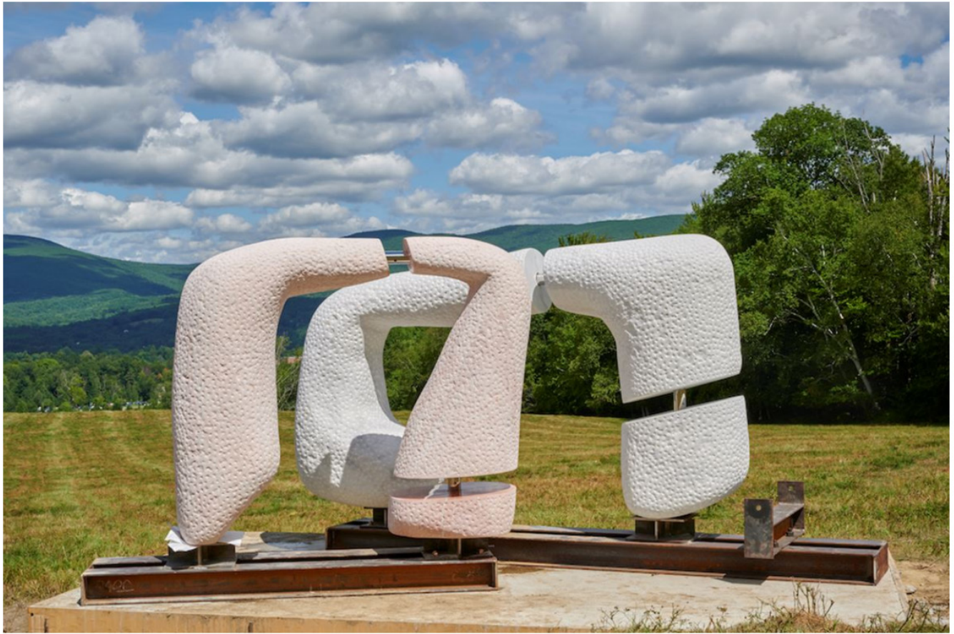
Installation of Knee and Elbow in process, August 2020.

So Knee and Elbow was made specifically at the behest of the Clark Art Institute; will it be installed there for a period of time?