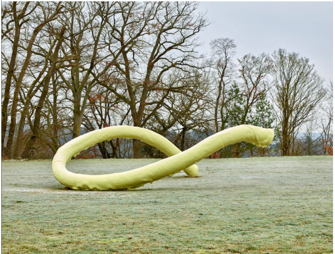
Nairy Baghramian, Beliebte Stellen / Privileged Points (2017). Dimensions variable. Exhibition view: Privileged Points , Mudam – Musée d'Art Moderne Grand-Duc Jean, Luxembourg (19 January–22 September 2019). Courtesy the artist and Marian Goodman Gallery. Photo: Remi Villagi.

Failure isn't a goal, but if something isn't successful, it's not there forever—it's going to change, and I think that gives you more latitude and opens up your imagination as to what is possible. I hope that our audiences were able to register this in the first iteration of the presentation. That's how we will continue in the future—we're going to take objects that are beloved by our public and sometimes present them in contexts that are familiar and other times in contexts that are new, and I think that there's room for both. Especially when you think about space, not only in physical terms but also durational: things happen over time.