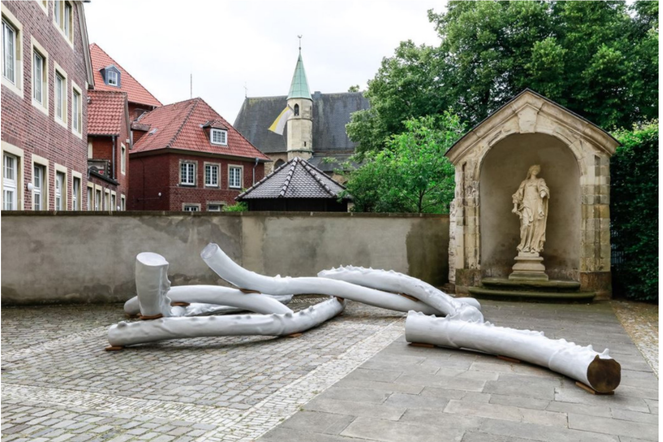
Nairy Baghramian, Beliebte Stellen / Privileged Points (2017). Skulptur Projekte Münster (10 June–1 October 2017).

Regardless of intent, what history has shown is that sculpture is mobile. Permanence is not at all guaranteed; your work acknowledges that and works it into the subject matter.