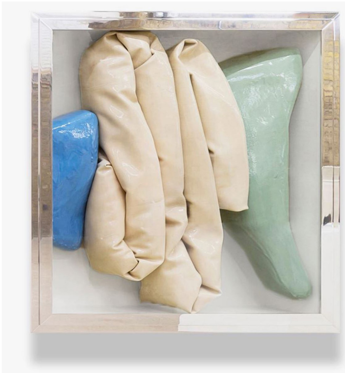
Nairy Baghramian, Gorge (double bend) (2017). Polished and sanded aluminium, glass, epoxy resin, polyurethane foam, fabric, silicon. 128.3 x 116.8 x 38.1 cm. Courtesy the artist and Marian Goodman Gallery.

Nairy Baghramian: Ambivalent Abstraction Pobocho, Paulina Ocula, August 28, 2020