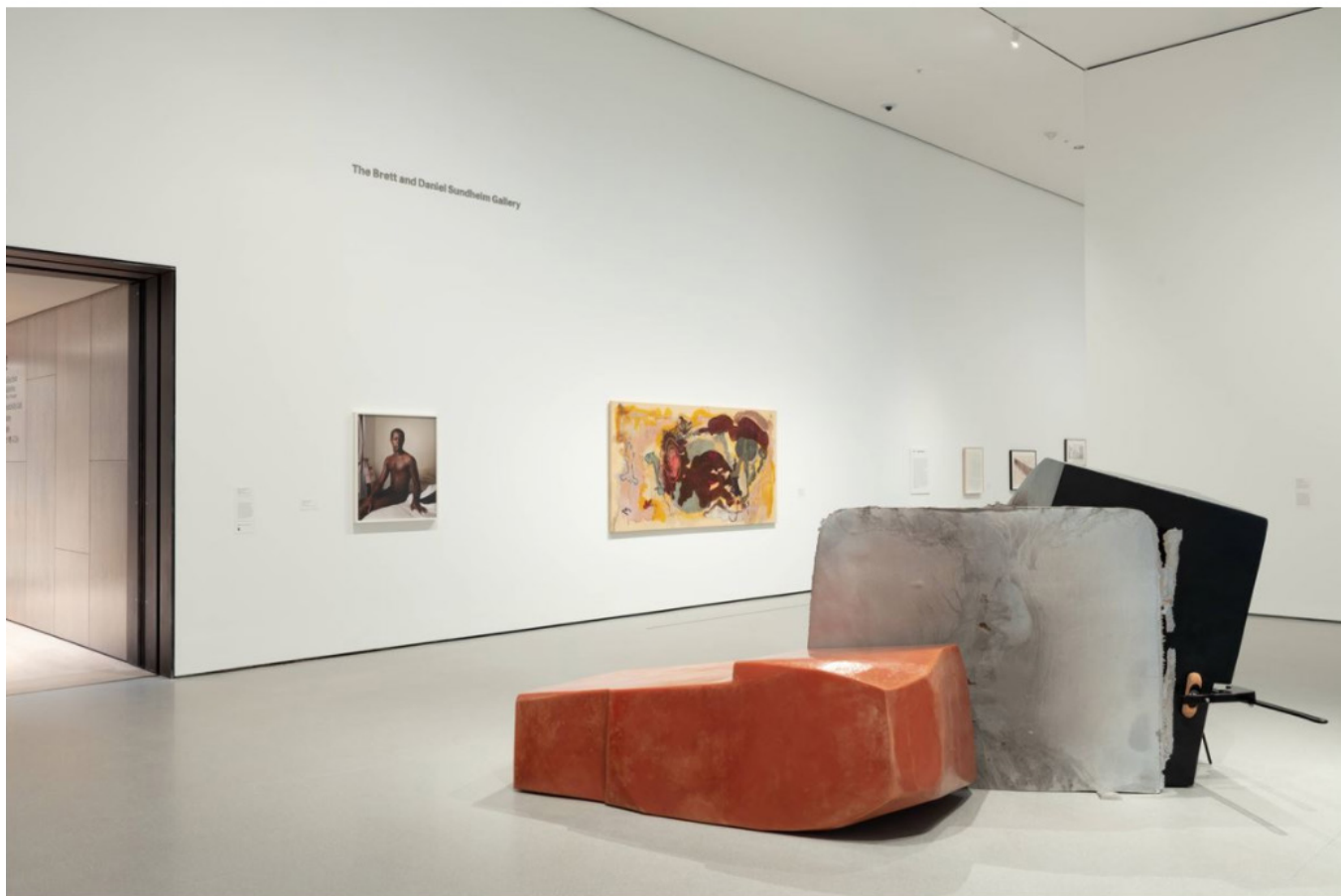
Nairy Baghramian, Maintainers A (2018). Pigmented wax over styrofoam, cast aluminium, and painted aluminium clamp with cork. Overall approximately 164 x 370 x 230 cm. Exhibition view: Worlds to Come , Gallery 215, The Museum of Modern Art, New York. Fund for the Twenty-First Century. © 2020 Nairy Baghramian.

It was an amazing experience to go through the exhibition. I was discussing the first iteration with art historians, artists, and journalists and there was an irritation in the discussion about the canon, and the fact that it triggered confusion and problems and questions meant that it's already a success. Curating should not only be representational—it should also raise questions and create doubts.