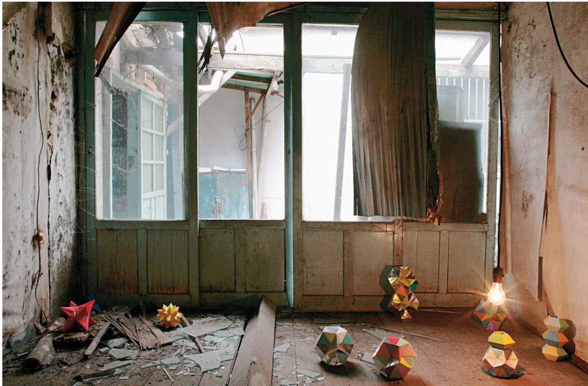
Yang's 2006 installation "Sadong 30," in an abandoned home in Incheon, South Korea. Haegue Yang, "Sadong 30," 2006, installation view, light bulbs, strobes, light chains, mirror, origami objects, drying rack, fabric, fan, viewing terrace, cooler, mineral-water bottles, chrysanthemums, garden Balsams, wooden bench, wall clock, fluorescent paint, woodpiles, spray paint, IV stand in an abandoned home in Incheon, South Korea

Today, Yang has made peace with the market. She is represented by galleries on three continents and her works are a ubiquitous presence at art fairs, where her larger pieces sell for six figures. "I keep losing my faith, but then I regain it," she said. The art world might be "vain" and "parasitic," but "at the same time, this is also often a shelter for so many minor voices" with "so much more tolerance that you cannot find anywhere else." This isn't to say she doesn't still come home "depressed" and "disgusted" from some of the obligatory social functions that come with the job, but she has also come to embrace her position within the industry, if somewhat ambivalently. "I want to be critical but at the same [time] I don't want to be someone who keeps complaining," she said.