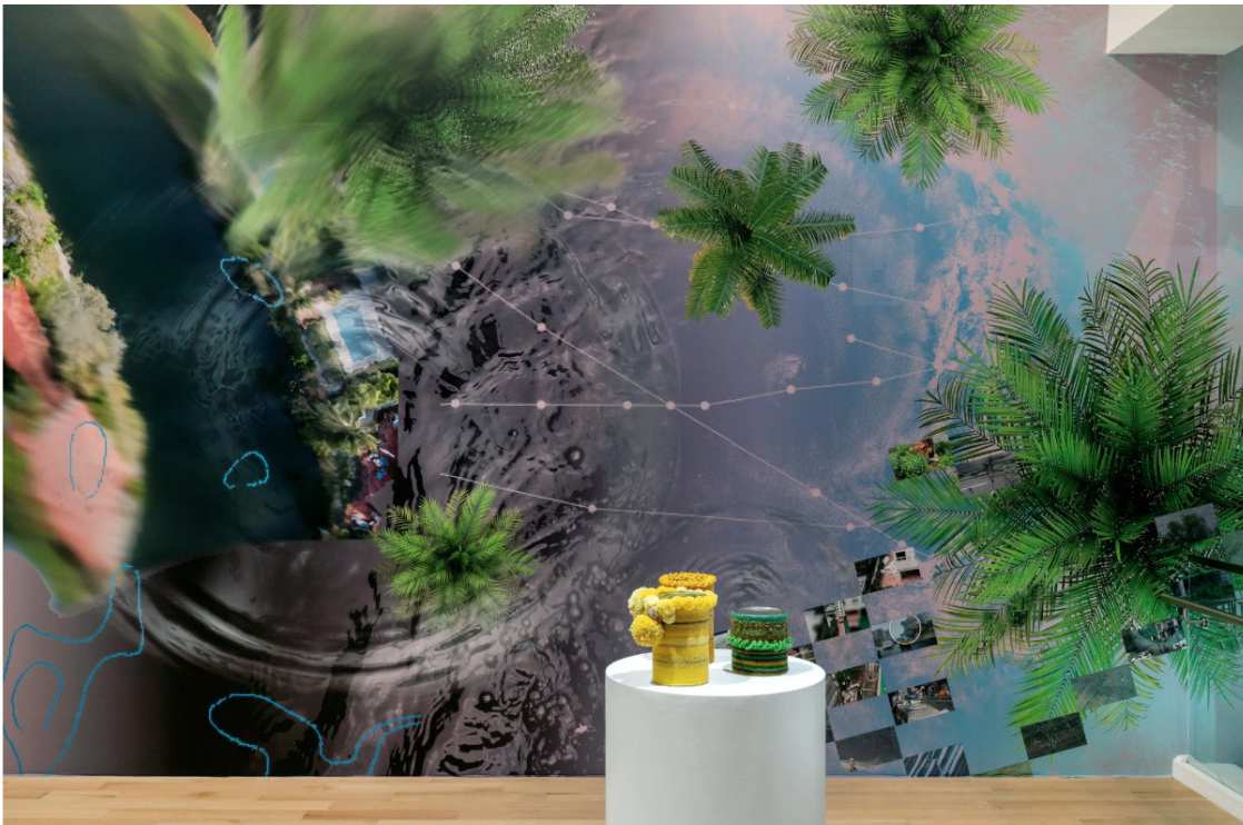
An installation view of "Haegue Yang: In the Cone of Uncertainty," on view at The Bass Museum of Art, Miami Beach, that includes the artist's "Coordinates of Speculative Solidarity" (2019) and "Can Cosies Triple Jumbo" (2013).

ON A RECENT afternoon at MoMA, more than 100 people were looking at Yang's installation in the atrium: a menagerie of large abstract sculptures covered in thousands of gleaming, spherical bells. Five performers danced the wheeled pieces around the space in lilting arcs. Trails of black and iridescent vinyl polygons fanned across the floor and up the walls, as though an elaborate origami creature was in the process of unfolding itself. Audio of chirping birds played through speakers overhead.