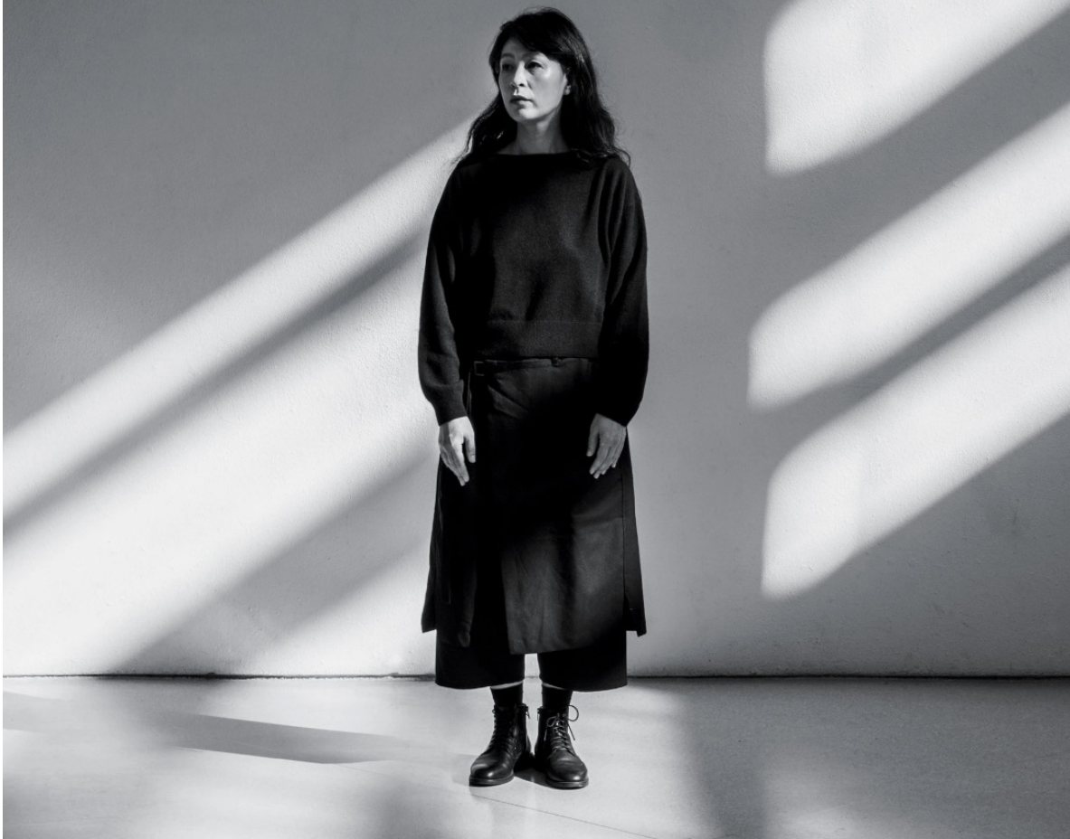
Haegue Yang, photographed in Miami on Dec. 4, 2019. The artist's work looks at themes including grief, loss and cultural identity.