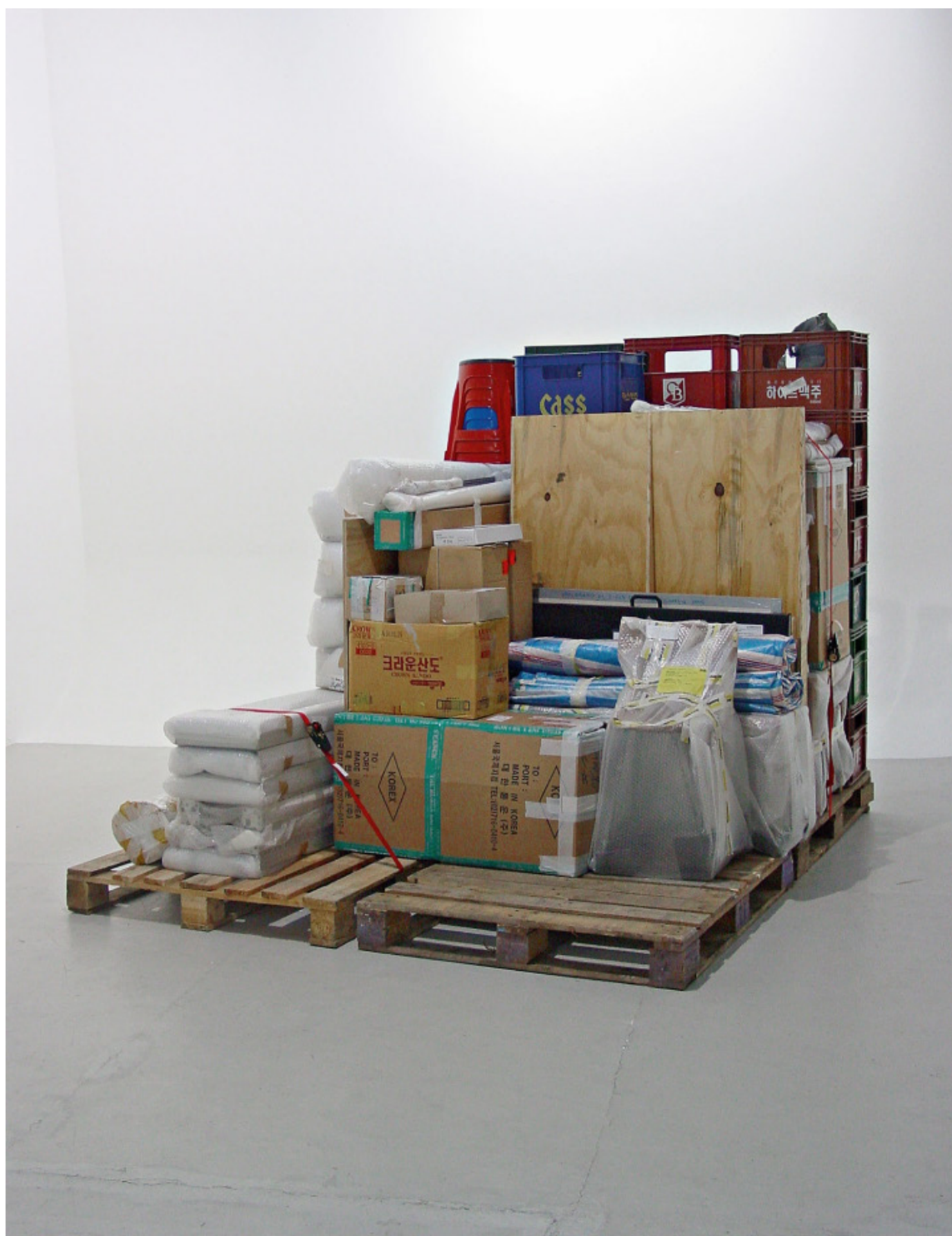
Yang's 2004 "Storage Piece," a sculptural installation of some of her older artworks that have been wrapped and stacked. Haegue Yang, "Storage Piece," 2004, installation view, wrapped and stacked art works, Euro pallets, dimensions variable, Haubrok Collection, Berlin, photo by Lawrence O'Hana Gallery, image courtesy of the artist and Greene Naftali, New York