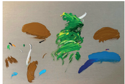
Perception of danger, 2021

Acrylic on canvas 59.4 x 84.1 x 4 cm (23.39 x 33.11 x 1.57 in.)