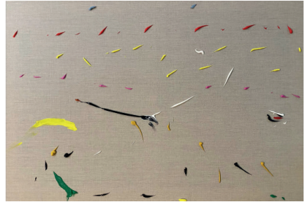
The best is yet to come, 2021

Acrylic on canvas 59.4 x 84.1 x 4 cm (23.39 x 33.11 x 1.57 in.)