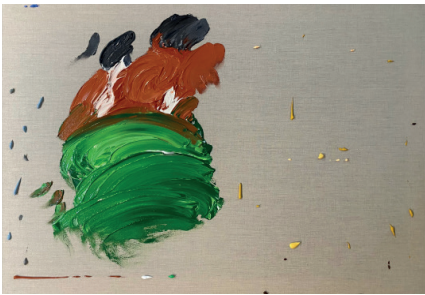
Ears dish, 2021

Acrylic on canvas 59.4 x 84.1 x 4 cm (23.39 x 33.11 x 1.57 in.)