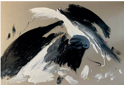
Cuban in search of Tokyo, 2021

Acrylic on canvas 59.4 x 84.1 x 4 cm (23.39 x 33.11 x 1.57 in.)