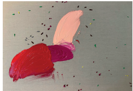
Letizia's niece, 2021

Acrylic on canvas 59.4 x 84.1 x 4 cm (23.39 x 33.11 x 1.57 in.)