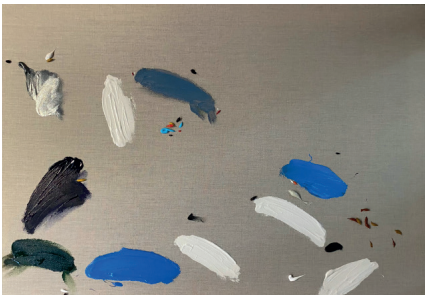
Regarding diversity, 2021

Acrylic on canvas 59.4 x 84.1 x 4 cm (23.39 x 33.11 x 1.57 in.)