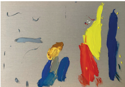
The economic contraction, 2021

Acrylic on canvas 59.4 x 84.1 x 4 cm (23.39 x 33.11 x 1.57 in.)