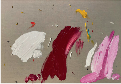
The capital of the capital, 2021

Acrylic on canvas 59.4 x 84.1 x 4 cm (23.39 x 33.11 x 1.57 in.)