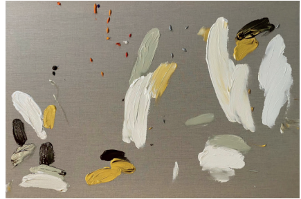
Gifts over 48 dollars, 2021

Acrylic on canvas 59.4 x 84.1 x 4 cm (23.39 x 33.11 x 1.57 in.)