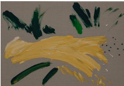
World coffee production, 2021

Acrylic on canvas 59.4 x 84.1 x 4 cm (23.39 x 33.11 x 1.57 in.)