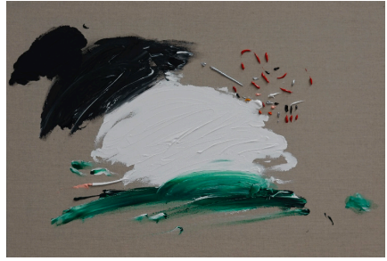
First wireless interface chip, 2021

Acrylic on canvas 59.4 x 84.1 x 4 cm (23.39 x 33.11 x 1.57 in.)