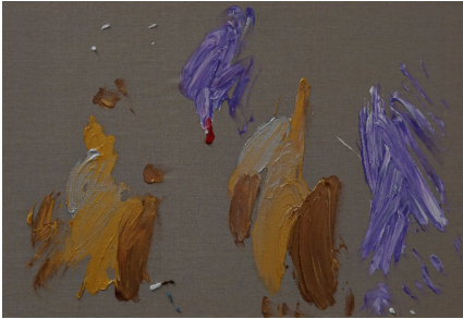
The attendees of the awards, 2021

Acrylic on canvas 59.4 x 84.1 x 4 cm (23.39 x 33.11 x 1.57 in.)