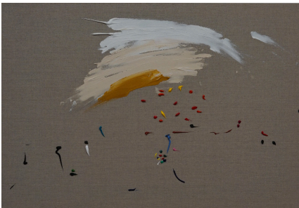
A world where people recognize 5 genders, 2021

Acrylic on canvas 59.4 x 84.1 x 4 cm (23.39 x 33.11 x 1.57 in.)