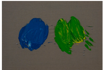
Green cars on the rise, 2021

Acrylic on canvas 59.4 x 84.1 x 4 cm (23.39 x 33.11 x 1.57 in.)