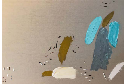
Couple Finances, 2021

Acrylic on canvas 59.4 x 84.1 x 4 cm (23.39 x 33.11 x 1.57 in.)