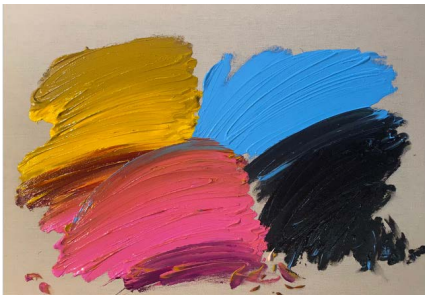
The Autopilot, 2021

Acrylic on canvas 59.4 x 84.1 x 4 cm (23.39 x 33.11 x 1.57 in.)