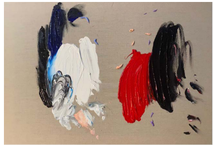
The Danzón Crisis, 2021

Acrylic on canvas 59.4 x 84.1 x 4 cm (23.39 x 33.11 x 1.57 in.)