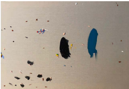
A Symbol of Marihuana, 2021

Acrylic on canvas 59.4 x 84.1 x 4 cm (23.39 x 33.11 x 1.57 in.)