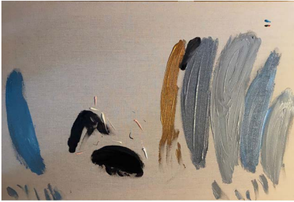
The Theft of the Purple Diamond, 2021

Acrylic on canvas 59.4 x 84.1 x 4 cm (23.39 x 33.11 x 1.57 in.)