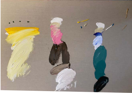
Everything to deliver, 2021

Acrylic on canvas 59.4 x 84.1 x 4 cm (23.39 x 33.11 x 1.57 in.)