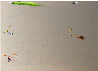
Martin's severe accident, 2021

Acrylic on canvas 59.4 x 84.1 x 4 cm (23.39 x 33.11 x 1.57 in.)