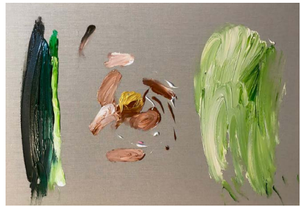
Four bengal tigers in havana, 2021

Acrylic on canvas 59.4 x 84.1 x 4 cm (23.39 x 33.11 x 1.57 in.)