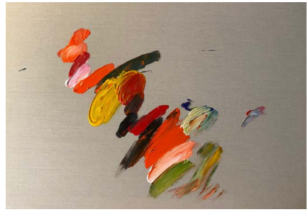
Live ranking, 2021

Acrylic on canvas 59.4 x 84.1 x 4 cm (23.39 x 33.11 x 1.57 in.)