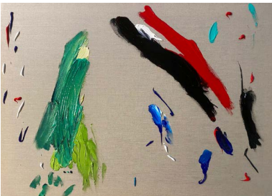
A mambi, 2021

Acrylic on canvas 59.4 x 84.1 x 4 cm (23.39 x 33.11 x 1.57 in.)