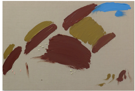
Golden passport, 2021

Acrylic on canvas 59.4 x 84.1 x 4 cm (23.39 x 33.11 x 1.57 in.)