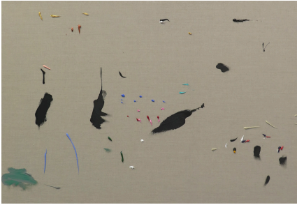
The inequality, 2021

Acrylic on canvas 59.4 x 84.1 x 4 cm (23.39 x 33.11 x 1.57 in.)