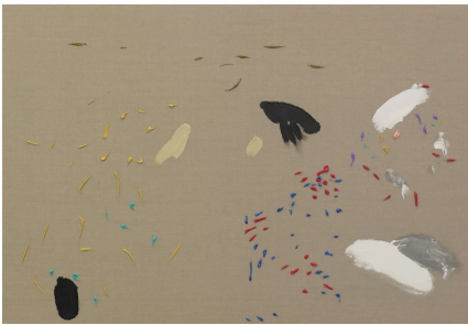
They sleep with girls that were very drunk, 2021

Acrylic on canvas 59.4 x 84.1 x 4 cm (23.39 x 33.11 x 1.57 in.)