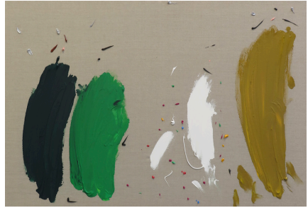
It was an intervention, 2021

Acrylic on canvas 59.4 x 84.1 x 4 cm (23.39 x 33.11 x 1.57 in.)