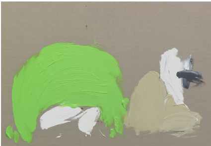
Too invasive, 2021

Acrylic on canvas 59.4 x 84.1 x 4 cm (23.39 x 33.11 x 1.57 in.)