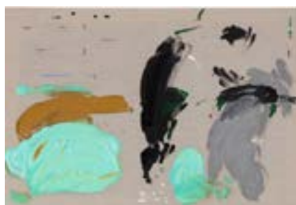
Técnico de Santos, 2021

Acrylic on canvas 59.4 x 84.1 x 4 cm (23.39 x 33.11 x 1.57 in.)