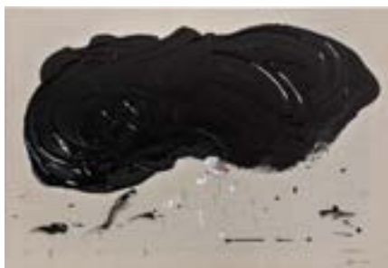
Dar la vuelta a la luna, 2021

Acrylic on canvas 59.4 x 84.1 x 4 cm (23.39 x 33.11 x 1.57 in.)