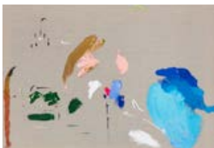
Las primarias a la Presidencia, 2021

Acrylic on canvas 59.4 x 84.1 x 4 cm (23.39 x 33.11 x 1.57 in.)